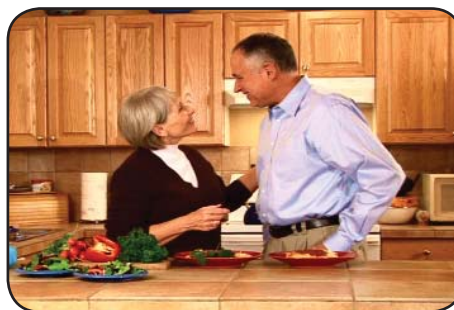
Bad breath can be embarrassing